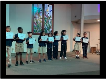
3 rd and 4 th Grade High Honor Role Students