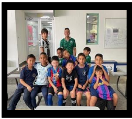
CCA Soccer Team Page 3