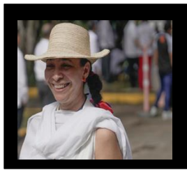
Interview with Mrs. Ombler Page 2