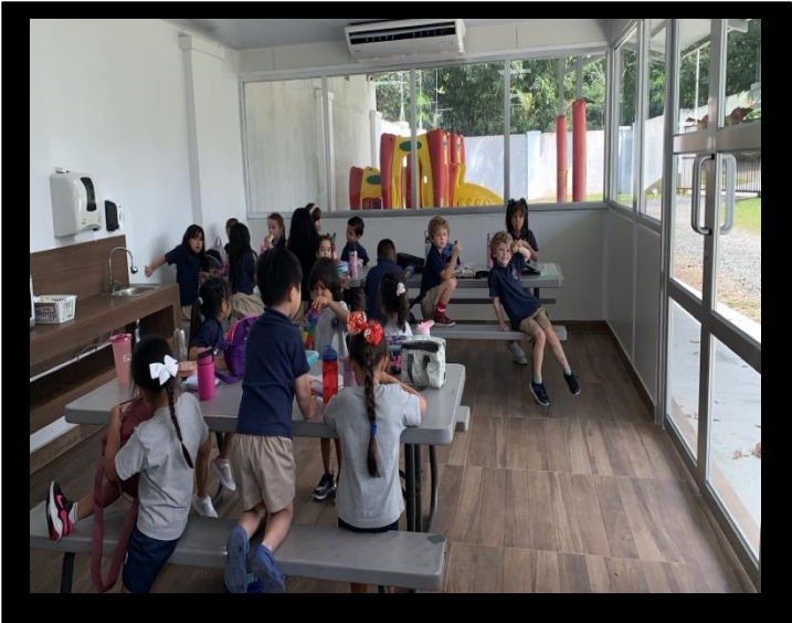
K4 and K5 students enjoying lunch in the newly remodeled cafeteria.

The cafeteria is a place to eat food. The new cafeteria has an air conditioner and windows. K3, K4, K5, 1st, 2nd, 3rd, 4th, 5th, and 6th grades eat there. When we were on vacation, CCA built it. We all like it very much.