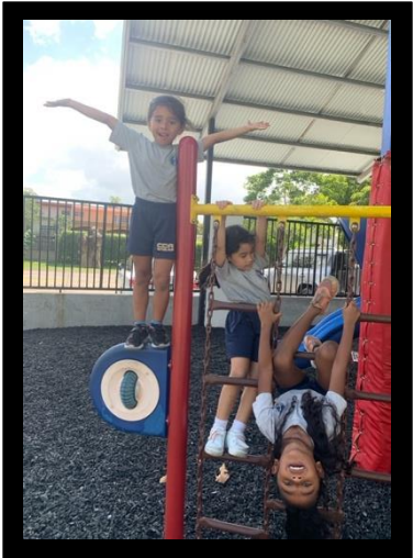
We love the park!