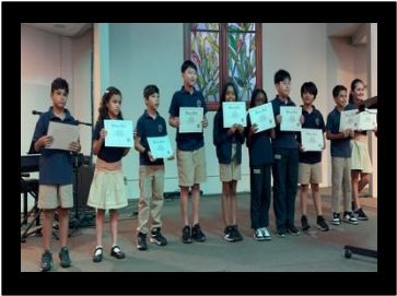
3 rd and 4 th Grade Honor Role Students

Honor Roll Chapel was on January 29, 2025. Students from 3 rd to 12 th grades received a certificate if they earned Honor Roll. All A's = High Honor Roll and All A's and B's = Honor Roll. If you earned C's or lower, you didn't get a certificate but you can try again to earn one this semester!