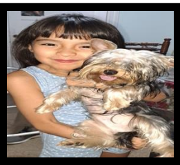
We Love Our Pets! Page 4