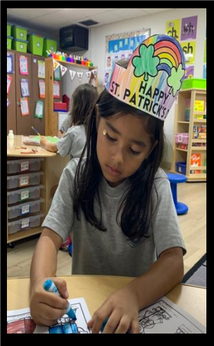
Happy St. Patrick’s Day!

Patrick was a boy that was kidnapped by pirates. He learn how to pray when he was kidnapped. When he pray God send pigs to eat. He want to tell people about Jesus so he use the shamrock. The shamrock can mean God the Father, God the Son, and God the Holy Spirit. People celebrate St. Patrick on March 17. They use leprechauns and rainbows and shamrocks and pots of gold. We learn it in K5. It was so much fun.