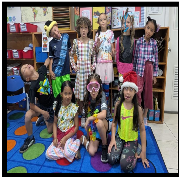
Second Grade students get creative for “Mix and Match” Day!