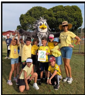
Second Grade students with Trinity!

They gave us oranges and watermelons for snacks and there were even popsicles for everyone at the end. It was a lot of fun!