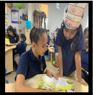
6 th grade student reads to a K5 student on the final Seuss-day.