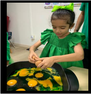
K5 student making “Green Eggs & Ham”