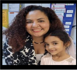
Parents in the Classroom Page 2