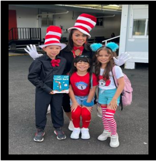
The Cat in the Hat on “favorite book character day”.