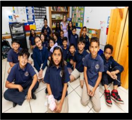
Local Author Visits CCA Page 3